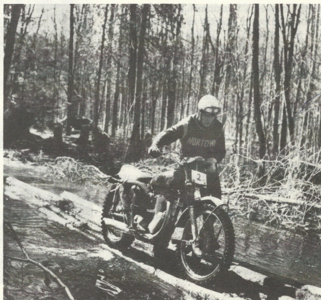
P. Puhakka of Willowdale, Ontario carefully guides his 500 AJS across the bridge at Beaver Pond.

On Sunday morning 34 stalwart rock jumpers set out to tackle the remaining 116.2 miles. All but five made it. Best score on Sunday was Scirpo's 33, followed by Lohnes, 39,