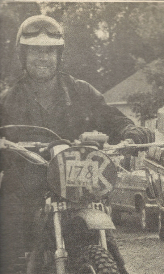
crosser par excellence, rode his Yamaha into the junior over-300-cc class to take the White Trophy for best Canadian junior in the Corduroy, the best ridden.